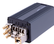
MuoN SFP Dual channel IP ST2110 encoder

Installed near your cameras or at the back of your monitor using FusioN miniature and quiet standalone converter.